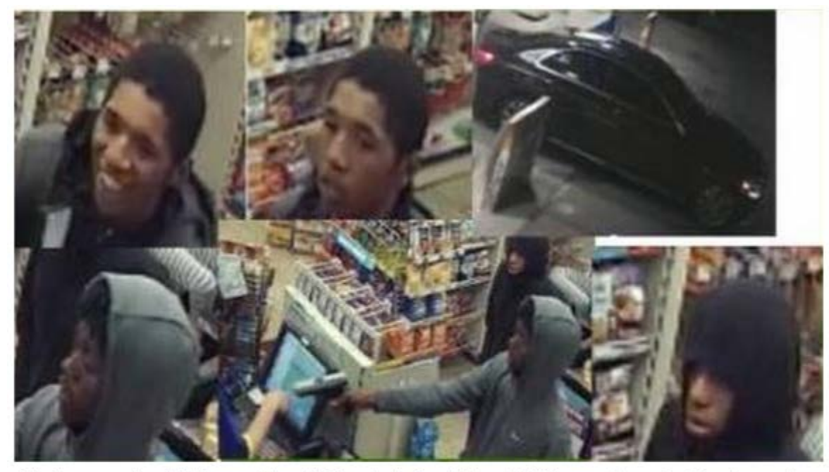
After two men put gas in their car and bought Gatorade at a Grand Mound AM/PM convenience store Tuesday morning, they returned 20 minutes later and robbed the place, according to the Thurston County Sheriff's Office.

Police searching for 'possible robbery suspects' in west Olympia