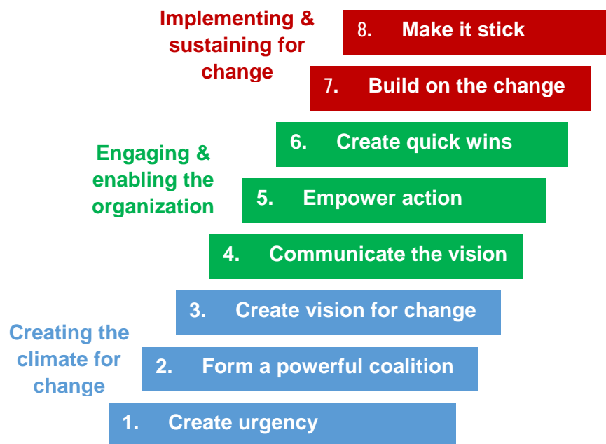
Figure A. John Kotter’s eight-step change management model.

A strong emphasis should be placed on involving leadership, human resources departments, business units and employees throughout the project process so they can claim ownership of their new workplace environment. There are many well-known change models, like Kotter’s eight-step change model (Figure A), that your agency can adopt.