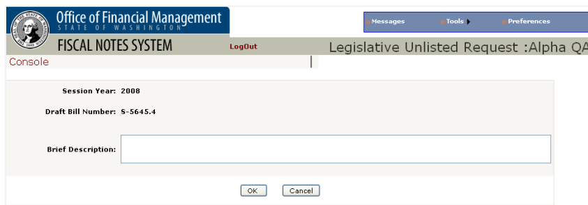
Figure 6: Legislative unlisted request page