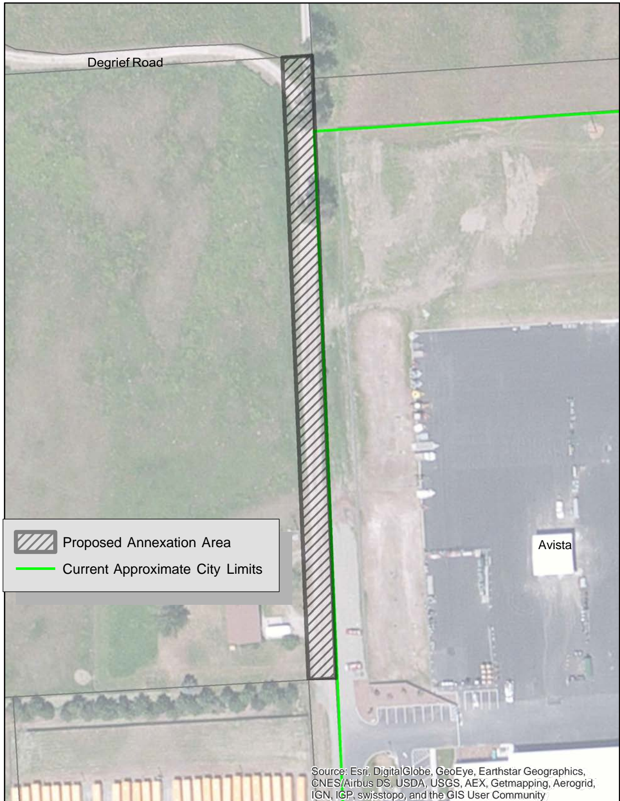
Exhibit A - Ordinance # 1548