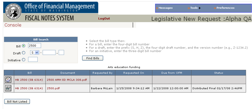
Figure 2: Legislative new request page

The table will indicate if requests have been made on any bill versions shown in the table, with the requester, the date requested, the due date and an indication of the fiscal note status (e.g. - unassigned, in process and distributed).